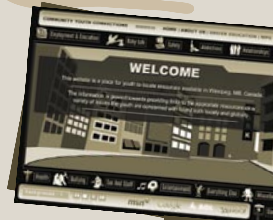
Community Youth Connections website

Explore the community at www.communityyouthconnections.ca .